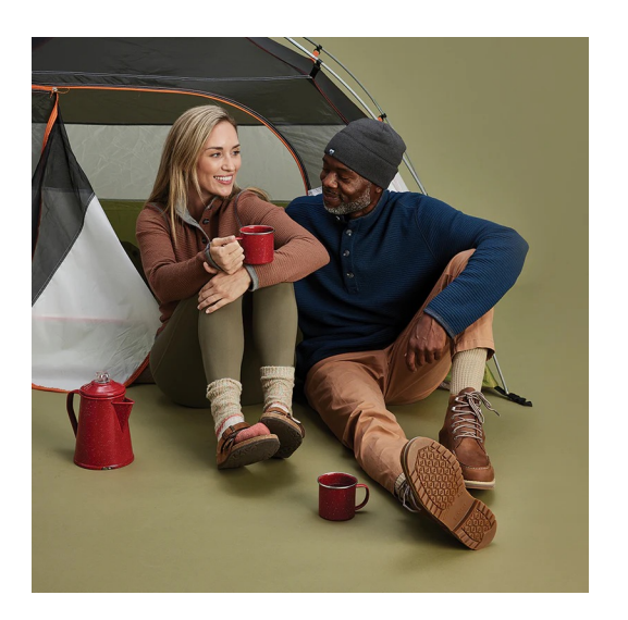
Maverick Button Up

Minimum 12 qty | $70.27 ea *as low as $63.55 at quantities