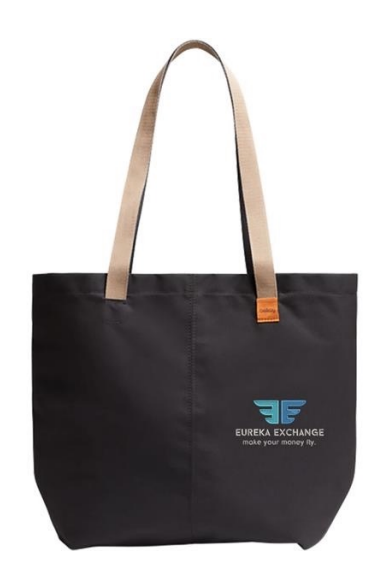
Flagship Cotton Crew

For every item purchased, this brand plants ten trees; they are proud to donate 1% of sales to nonprofits dedicated to protecting our planet through their partnership with 1% For The Planet.