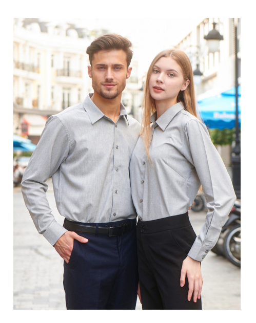
Sustainable Coffee Shirt

Minimum 12 qty | $82.33 ea *as low as $78.17 at quantities