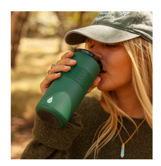
16oz. Artisan Tumbler

Nimble creates premium, ethical tech products that are better for the planet, incorporating sustainable materials, using 100% plastic-free packaging and recycling old tech for free while also partnering with 1% For The Planet.