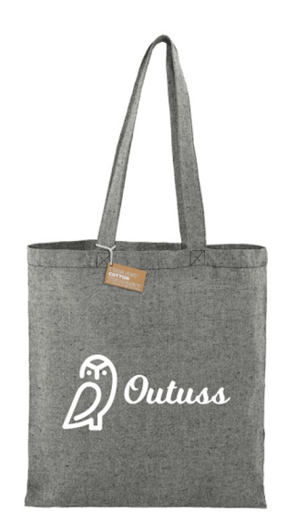
Recycled Cotton Twill Tote

Minimum 200 qty | $3.07 ea *as low as $2.29 at quantities