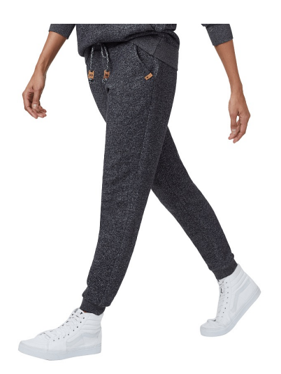
Tentree Atlas Sweatpant

Minimum 12 qty | $97.25 ea *as low as $90.77 at quantities