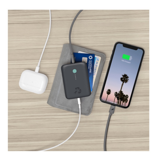
Champ Power Bank

Minimum 8 qty | $102.89 ea *as low as $81.65 at quantities