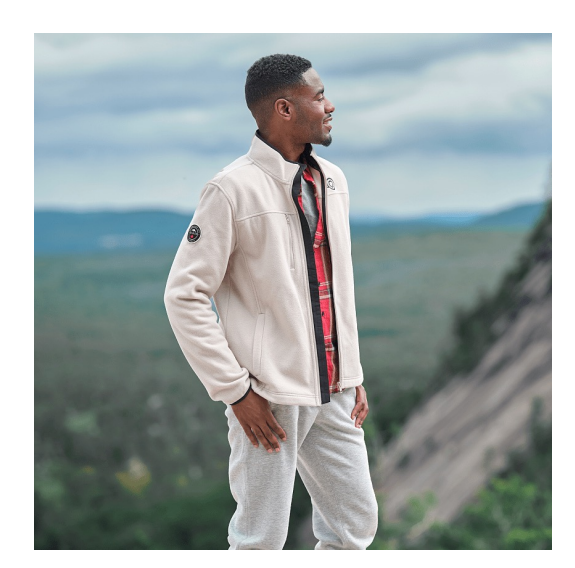
WESTVILLE Eco Microfleece Full Zip

Each year, MiiR invests a portion of top-line revenue into nonprofit organizations whose work empowers communities while benefiting the health of their natural environments. Through strategic trust-based grants, event sponsorships and inkind donations, MiiR supports organizations that work at the intersection of people and planet.