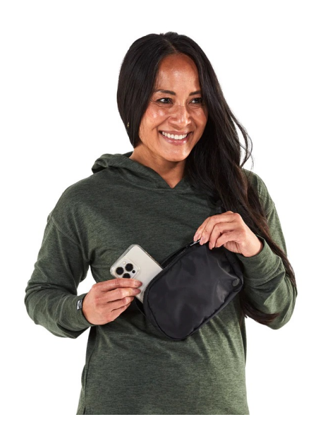
Explorer Belt Bag

Each style is made with high-quality recycled polyester which helps to keep plastic bottles from ending up in our oceans and landfills. This brand is partnered with 1% For The Planet and pledges to donate a portion of Earthwise sales to nonprofits committed to protecting our environment.