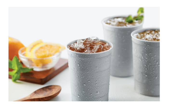
Recyclable Steel Chill-Cups

Elemental has partnered with Charity Water and others as part of their ongoing commitment to bring clean water and a better life to communities in need.