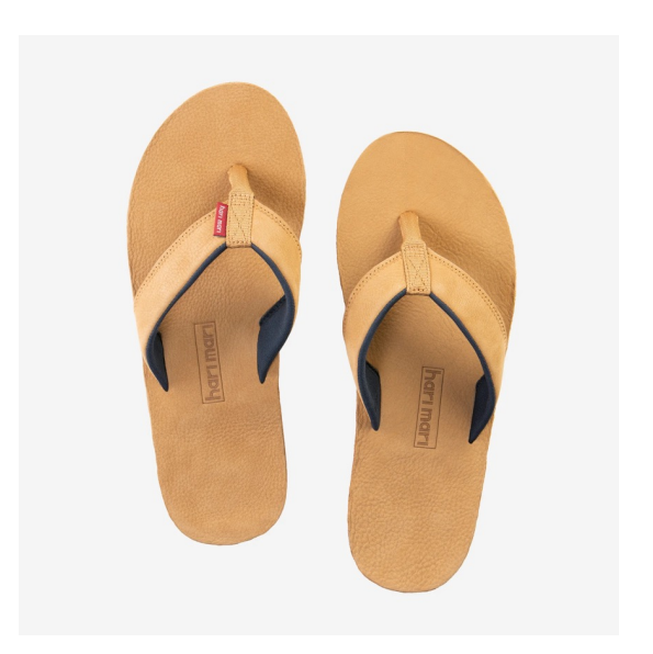
Men's Pier Flip Flop

Every RIPL bottle funds a full day of employment for a local in Bali to collect plastic from beaches, lifting them out of poverty. 1 bottle = 1 day of employment.