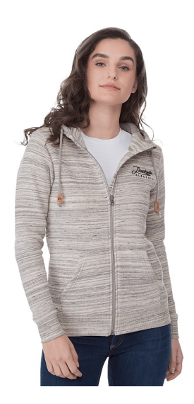
Women's Space Dye Zip Hoodie

Through a partnership with ProudPath and 1% For The Planet, one percent of sales of this and all EcoSmart products will be donated to nonprofits dedicated to protecting the planet.