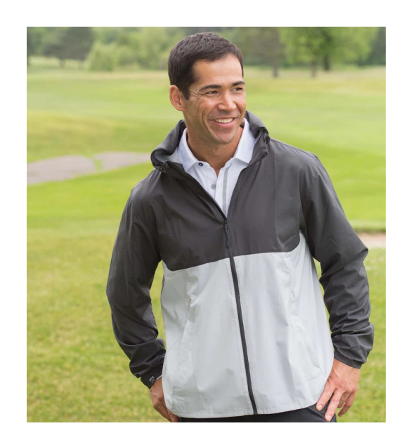
Men's Idealist Windbreaker

With a strong priority on sustainable sourcing through certified mills that focus on sustainable practices, water conservation, and environmentally safe chemicals, this brand is turning plastic into apparel. A portion of this brand's proceeds go towards 1% For The Planet and a goal of $5M to charity by 2030.